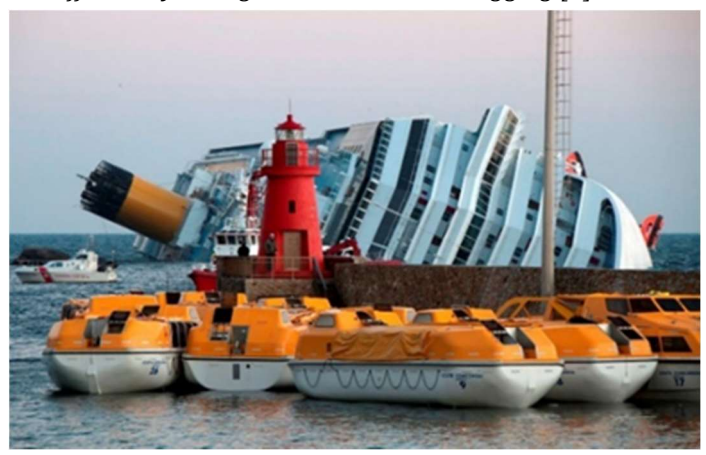
Fig. 2 - Cruiser "Costa Concordia" after disaster [5].