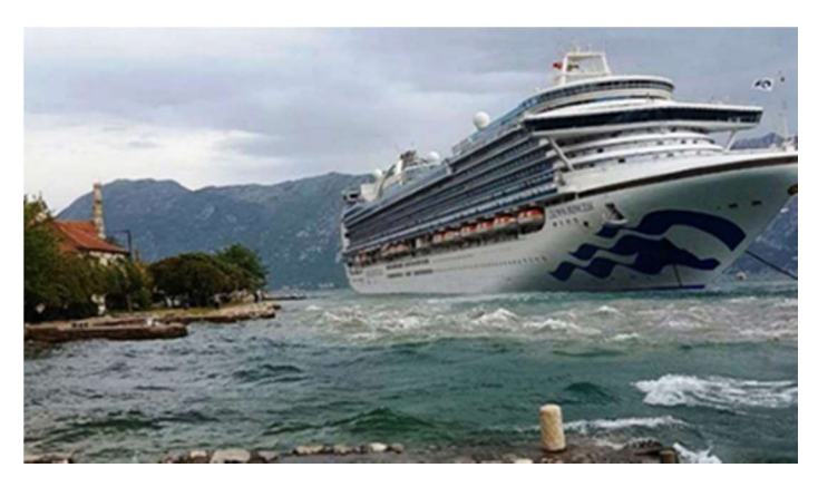
Fig. 1 – Cruiser "Crown Princess" photographed in close proximity of coast of Prcanj affected by strong wind and anchor dragging [4].

However, the questions that cannot be avoided and should be emphasized on the top level are: How much are we aware of the risks involved in maritime economy that could endanger our coast? Are we aware of the effect that only one accident could make to our precious jewel? Simply, could Figure 1 lead to Figure 2?