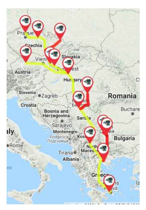
Fig. 2 - Rail intermodal connection of Piraeus port with its hinterland Source: [18]

Container transhipment is ca 500,000 TEU in Thessaloniki port, while the planned investments will increase the capacity to 1,300,000 TEU. During the launch of the first container train on the route Thessaloniki – Sofia, CEO of the Port of Thessaloniki Franco Nicola Cupolo stated that the Port of Thessaloniki is committed on the strategic development of intermodal railway transport to the Balkans, starting from November 27, 2020. With a direct train connection to the dry Port of Sofia owned by the Port of Thessaloniki [21].