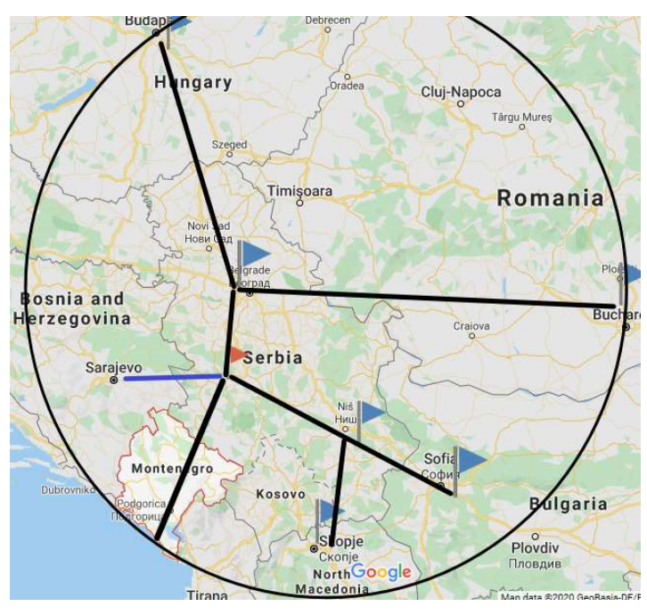
Fig. 3 - Example of Potential Connection of the Port of Bar with Dry Ports of Long and Medium Range in the Region