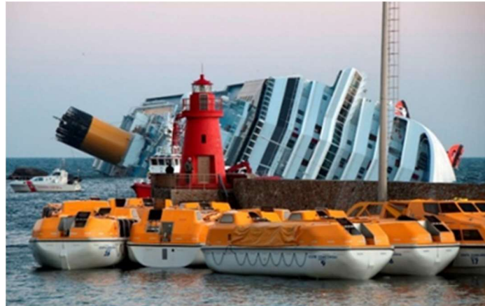
Fig. 2 – Cruiser “Costa Concordia” after disaster [5].