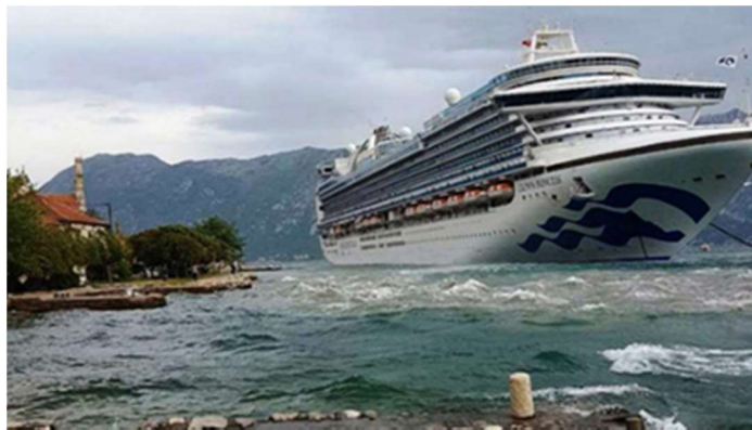
Fig. 1 – Cruiser “Crown Princess” photographed in close proximity of coast of Prcanj affected by strong wind and anchor dragging [4].

However, the questions that cannot be avoided and should be emphasized on the top level are: How much are we aware of the risks involved in maritime economy that could endanger our coast? Are we aware of the effect that only one accident could make to our precious jewel? Simply, could Figure 1 lead to Figure 2?